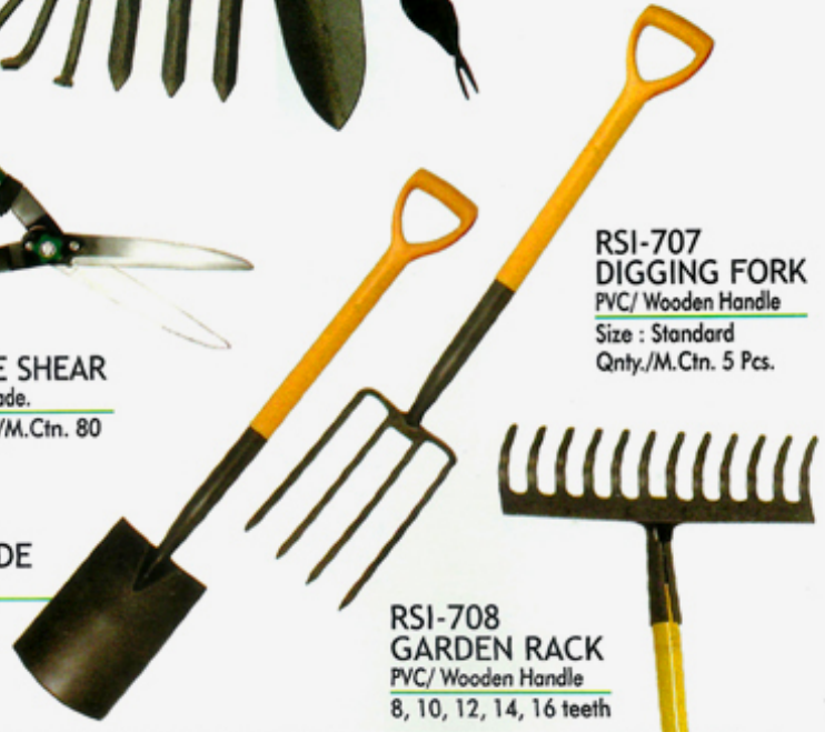
RSI-707 DIGGING FORK PVC/ Wooden Handle Size : Standard Qnty./M.Ctn. 5 Pcs.