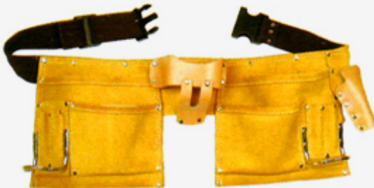
RSI-802 11 POCKET PROFESSIONAL SPLIT LEATHER CARPENTER APRON WITH WEB BELT

2 large main pockets, 2 medium size front nail pockets, 4 small pencil or tool pockets, 2 fixed metal hammer holders, 1 Tape holder,