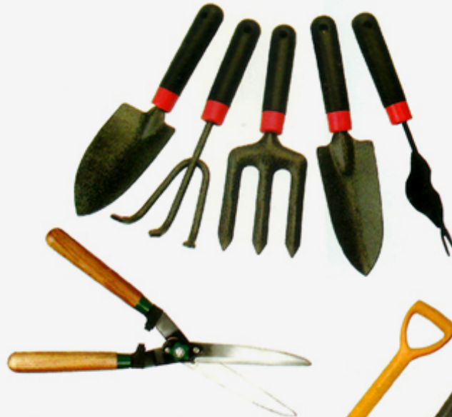
RSI-706 Garden Tools set of 5 Pcs. with plastic handle

All Shears are also available in wooden handle.