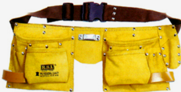
RSI-801 10 POCKET ECONOMY SPLIT LEATHER CARPENTER APRON WITH WEB BELT

2 large main pockets, 2 medium size front nail pockets, 6 small pencil or tool pockets, 2 leather hammer holder loops with metal tape holder.