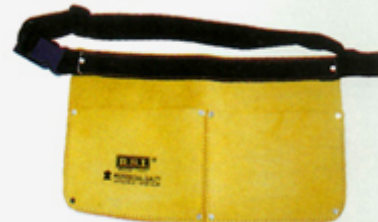
RSI-803 2 POCKET/1 POCKET SPLIT LEATHER NAIL BAG 1 hammer lop on belt. Adjustable web belt with plastic buckle

2 large main pockets, 2 medium size front nail pockets, 6 small pencil or tool pockets, 2 leather hammer holder loops with metal tape holder.