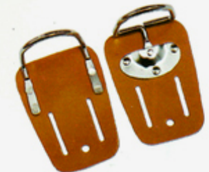
RSI-806 Hammer Holders Revolving & Fix Hammer Holder